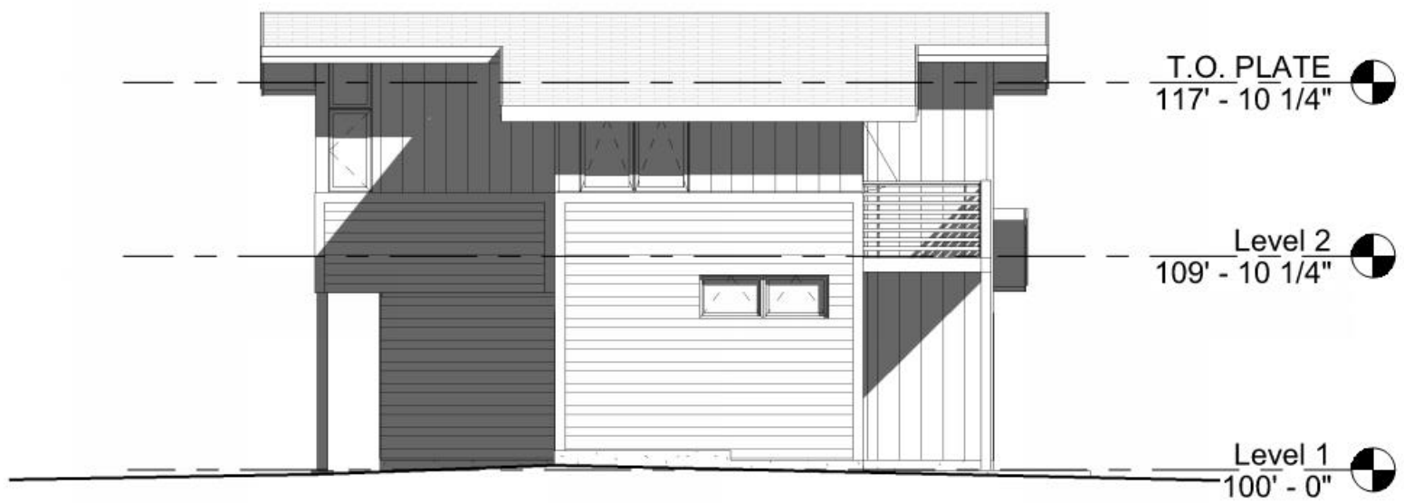
② WEST ELEVATION 1/8" = 1'-0"