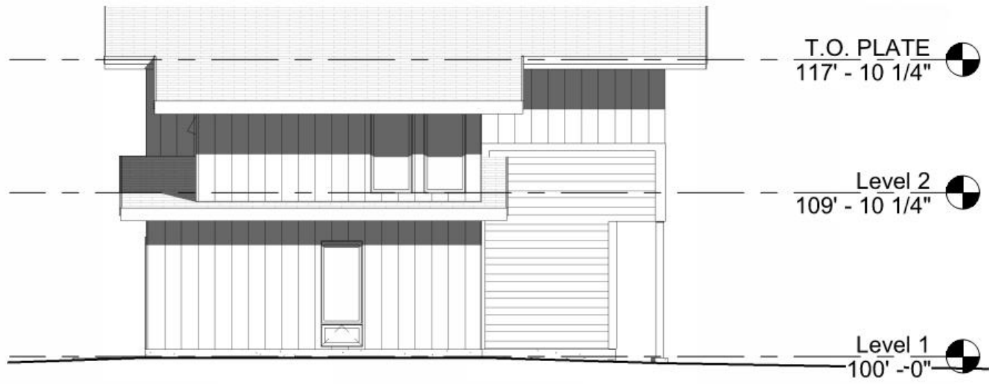
① EAST ELEVATION 1/8" = 1'-0"