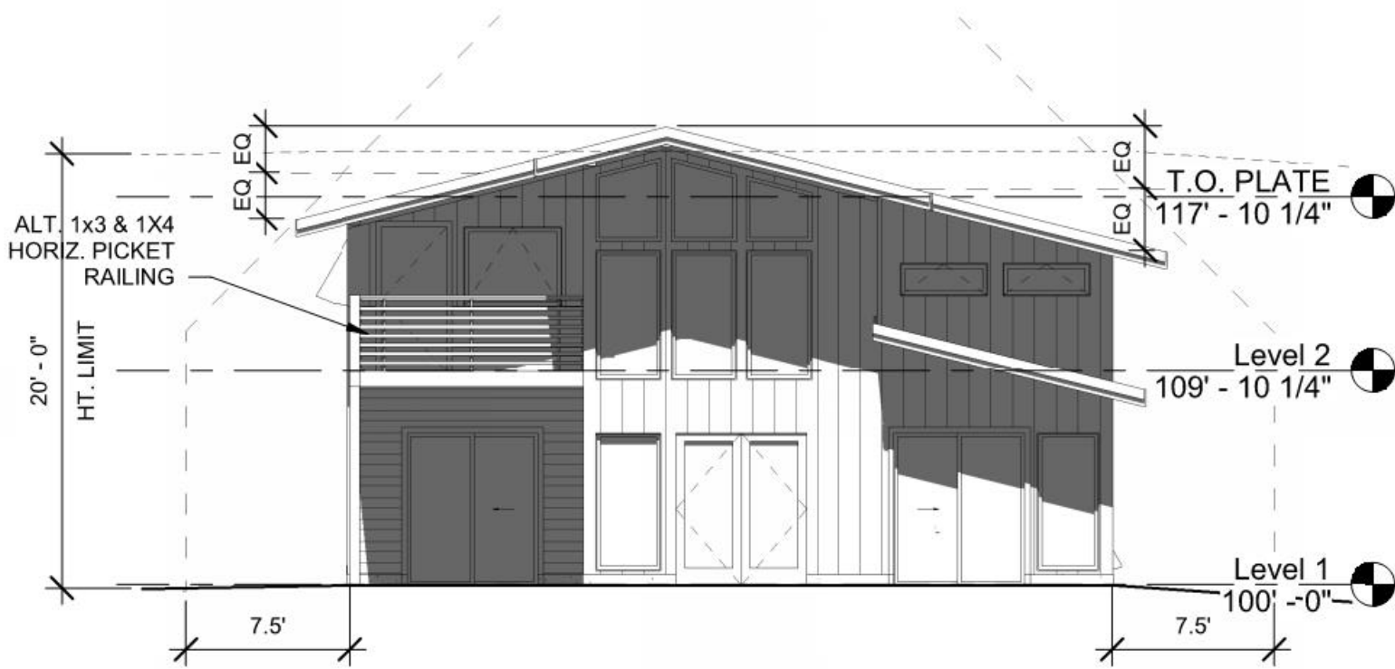
② SOUTH ELEVATION 1/8" = 1'-0"